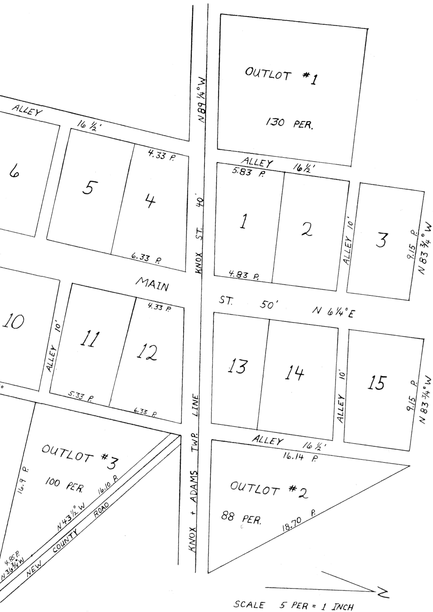
PLAT AND DESCRIPTION MANTUA ADAMS AND KNOX TWP.